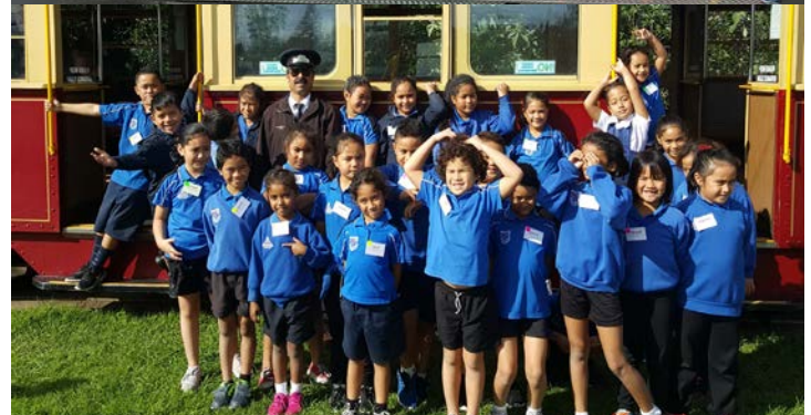
Hub 2 enjoying their day at MOTAT last week.